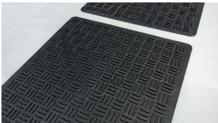
EVALON® maintenance walkway tiles for clearly marking roof areas people can safely walk on.

It is recommended to install the tiles with a joint spacing of more than 50 mm. alwitra EVATAACK may be visible at some parts along the edges. One cartridge will bond approx. 3 maintenance walkway tiles.