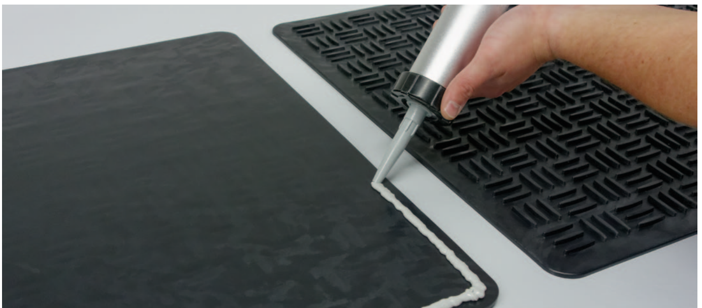
The paste-like alwitra EVATAACK adhesive and sealant is applied to the back of the maintenance walkway tiles.

Other fixing methods such as hot-air or solvent welding are not permitted.