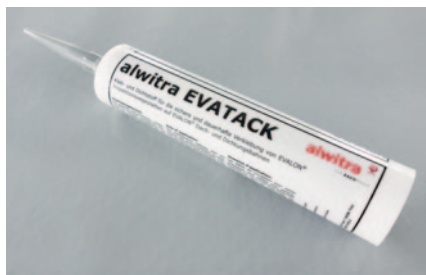
For application of alwitra EVATAACK, any standard caulking gun can be used.